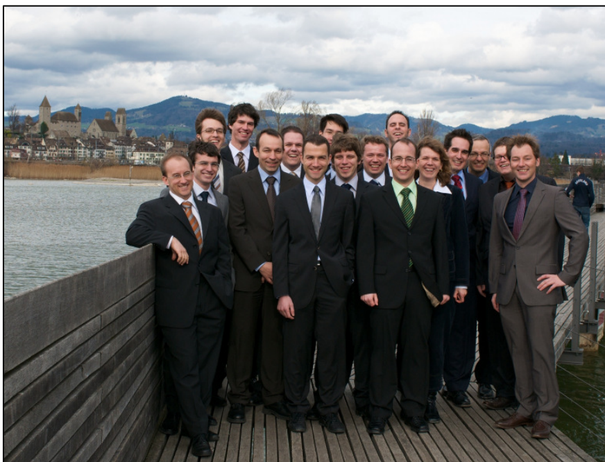
The Compass Security Team